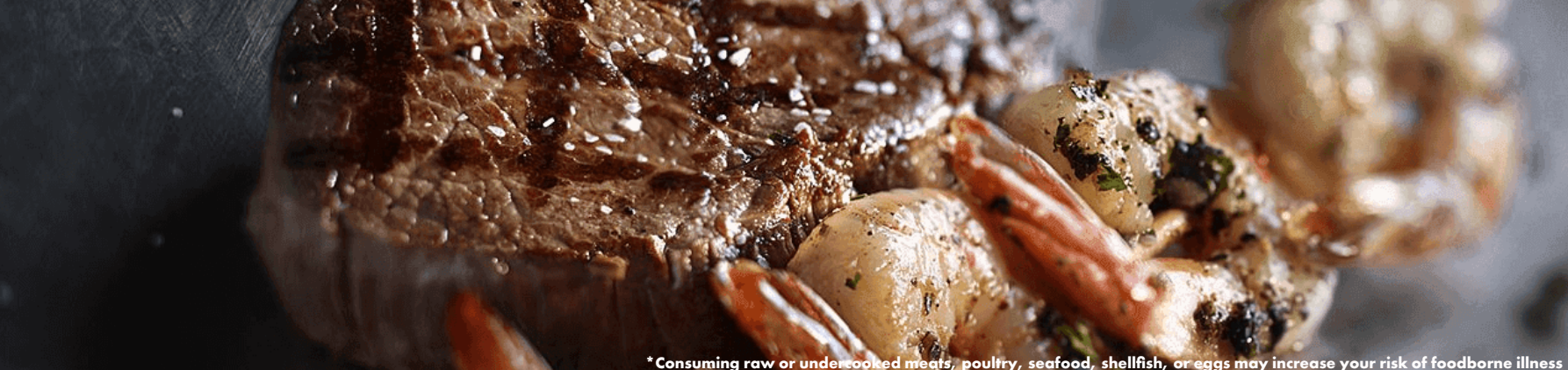
*Consuming raw or undercooked meats, poultry, seafood, shellfish, or eggs may increase your risk of foodborne illness