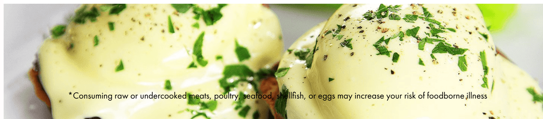
*Consuming raw or undercooked meats, poultry, seafood, shellfish, or eggs may increase your risk of foodborne illness

BISCUITS & GRAVY #172 (1) Biscuit & Gravy 6.99 | Add diced sausage or chorizo +2 #173 (2) Biscuits & Gravy 8.99 | Add diced sausage or chorizo +4